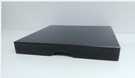
polished and fased granite plate with handle bars