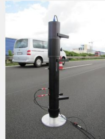
diameter 100 mm for in situ testing of dense asphalts (Module „Sound Absorption In situ“)