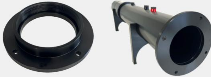
diameter 100 mm for laboratory testing + special adapter to connect 3D-printed meta-material structures to measure sound absorption